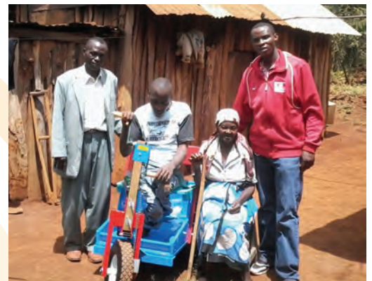
Our new partner's change this man's life! (page 2)