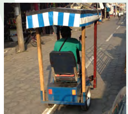
PETs make Entrepreneurs.

“ There is no exercise better for the heart than reaching down and lifting people up.”