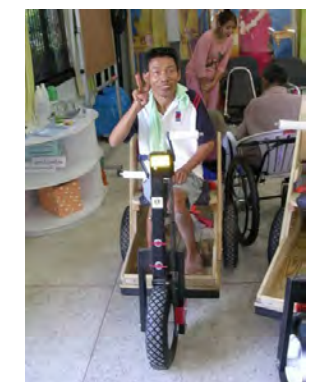
Paraplegic man starts a new life in Thailand.