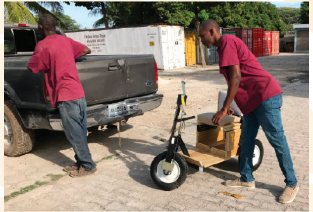
Delivery on its way in Haiti.