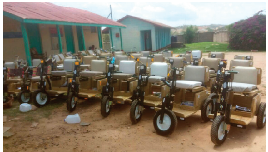
60 carts are reassembled & given out in Moyale, Kenya

Most of the recipients are Muslims. I tell you it was a wonderful opportunity to share the love of God with them and they were so humble to listen."