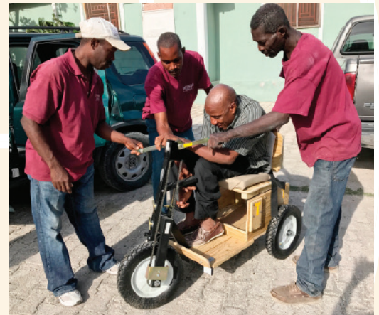
“man had dead legs”