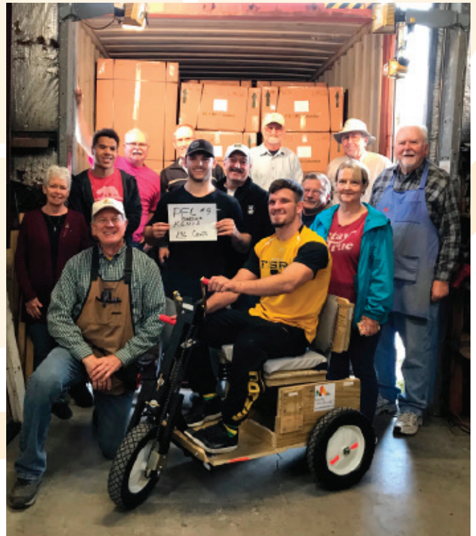
Mizzou wrestlers help load a shipment.

25 years of life changing events are ending; will you be part of the next 25 years?