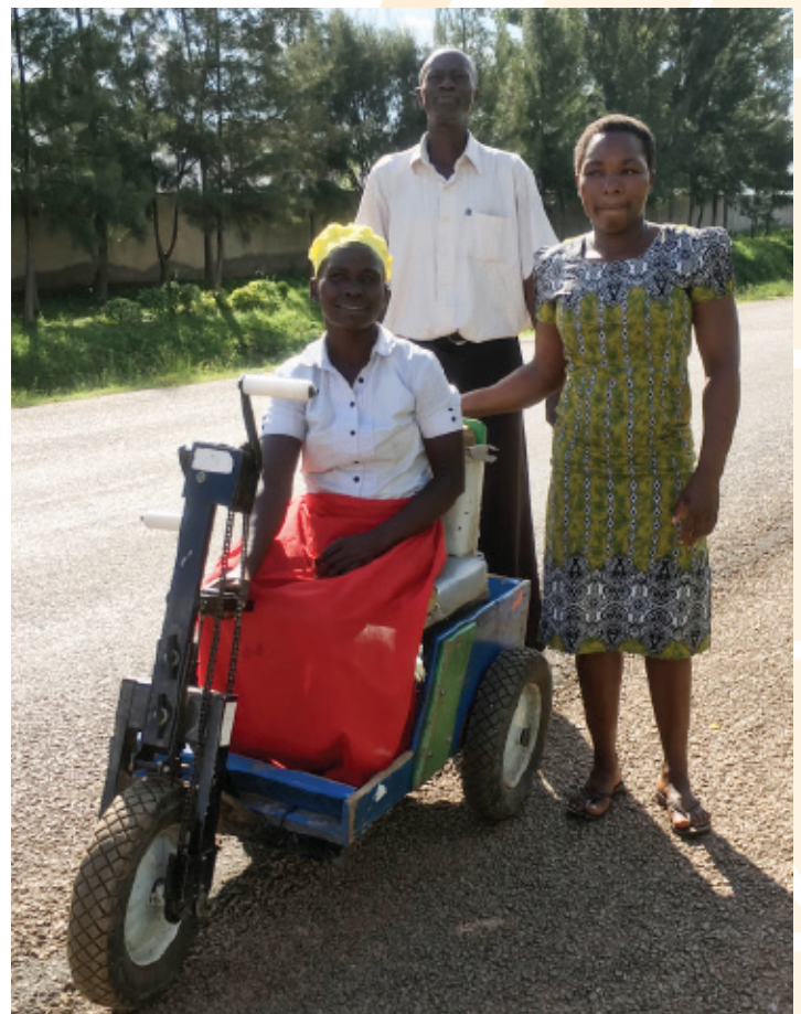
Kenyan family receives your gift.