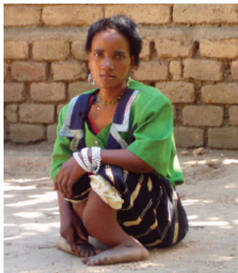
There are more mothers like this one that need your help.

THIS IS ONE OF MANY WAYS YOU CAN HELP BUILD & SHIP A CART.