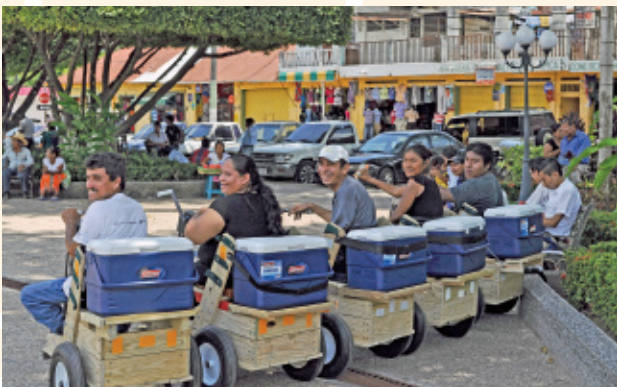
Hays on distribution in Guatemala Sept. 2010