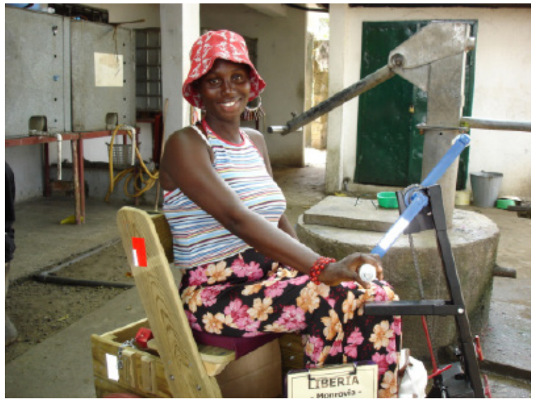
Young lady receives a cart in Liberia 2006 thru Samaritan's Purse.

The Columbia shop is blessed to have your support for 25 years. Imagine a community of cart users with big smiles the size of our town, pedaling to work, going to school, making a difference in their lives. We honor the recipients by pledging to continue changing lives until our 50 th Golden Anniversary. WE WILL WITH YOUR CONTINUED HELP!! See you in Austin.