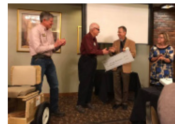
Founder receives honor and $6,000 check from Rotary Club.