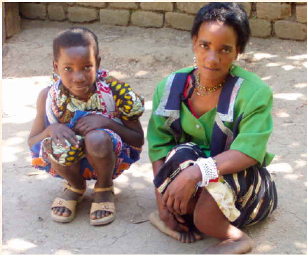
2006 Mother in Tanzania received a cart thru Mango Tree.