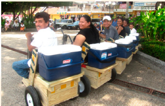
2011 Group in Guatemala receive carts with a Mini Mart to help start a business – mobility & more. The kit includes a resting shelf, cooler, and smaller storage containers and is popular with our distribution partners.