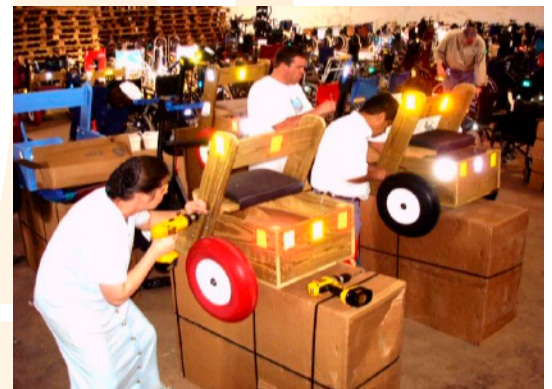
2005 Lady in a skirt with a drill reassembles our carts. Samaritan's Purse led this distribution effort in Eritrea, Africa.