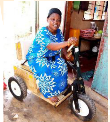
Janet had an accident 3 years ago.

Our volunteers are willing to build & load more carts. Can you help fund an increased production to 50 a week?