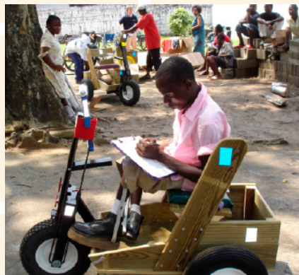
2006 Liberian student receives a cart; others in background assemble more. Check out his leg braces and special left shoe. I imagine he is filling out a form about himself in exchange for his new mobility. Not all pictures we receive show an evident need, but this one does.