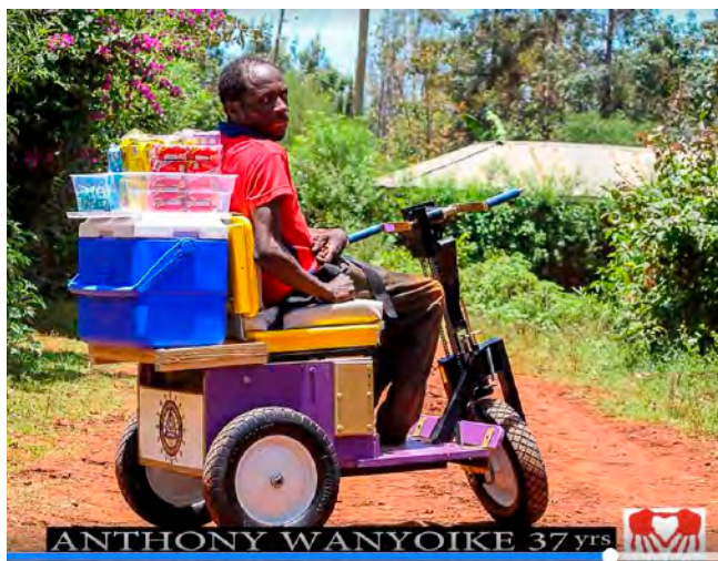
Cosmopolitan Club sponsored cart with a mini-mart.