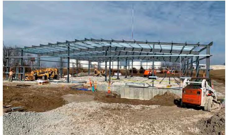
February 19th, steel framing going up.