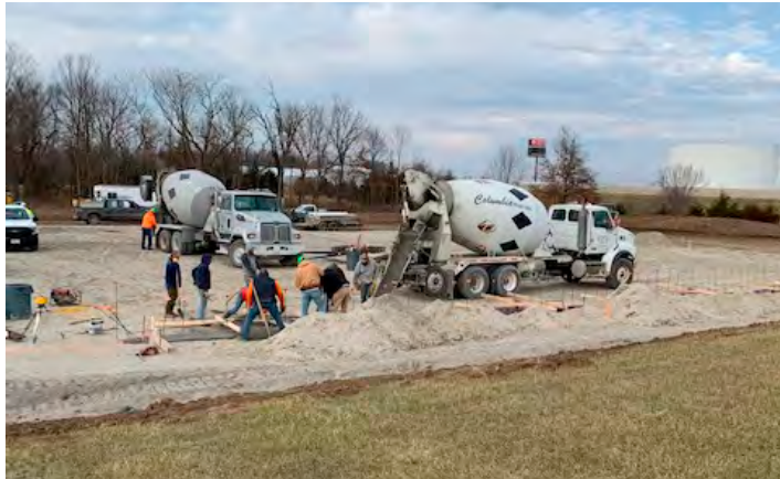
December 27th, concrete footings are poured.