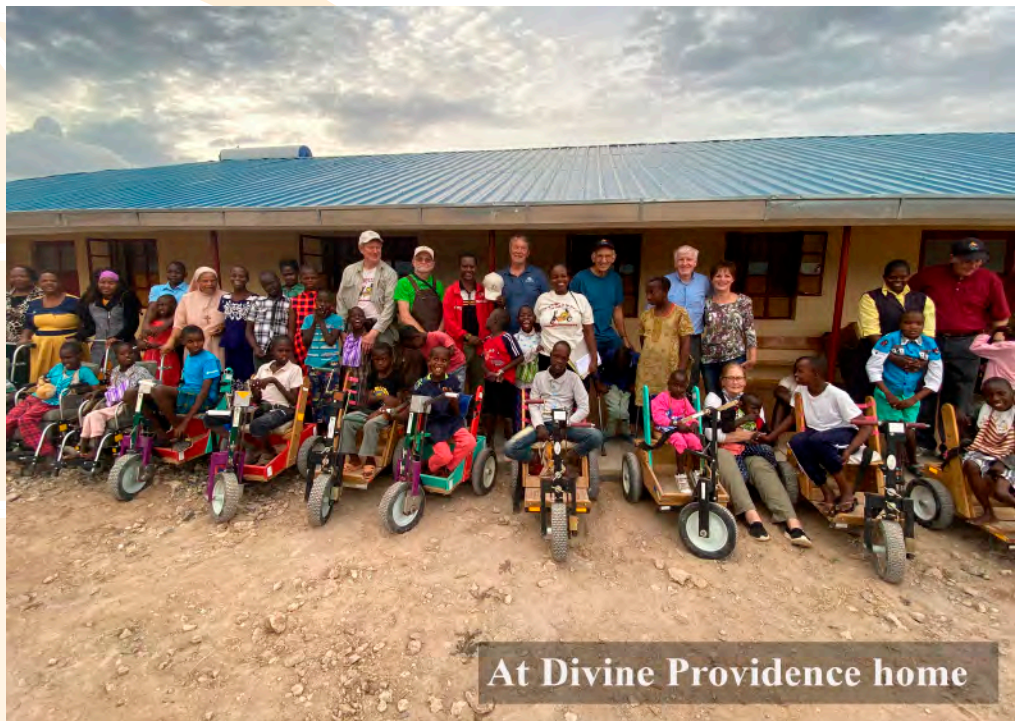
At Divine Providence home

Executive Director visits children with disabilities and performs cart maintenance.