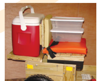
Mini-mart: cooler, deck platform, & containers for sale items.

PS: Check out the separate report Americares shared from Ghana.