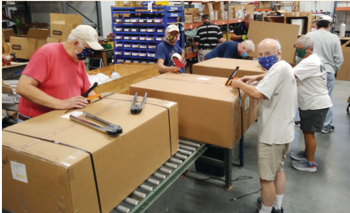
Packing happens in the Assembly room on Tuesdays.