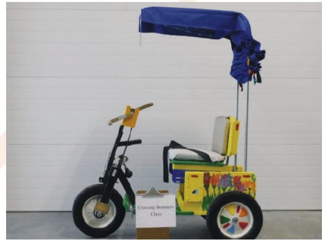
Crossing Boomers Class

PAGE 48 OF OUR FOUNDER’S BOOK, WHICH IS STILL AVAILABLE