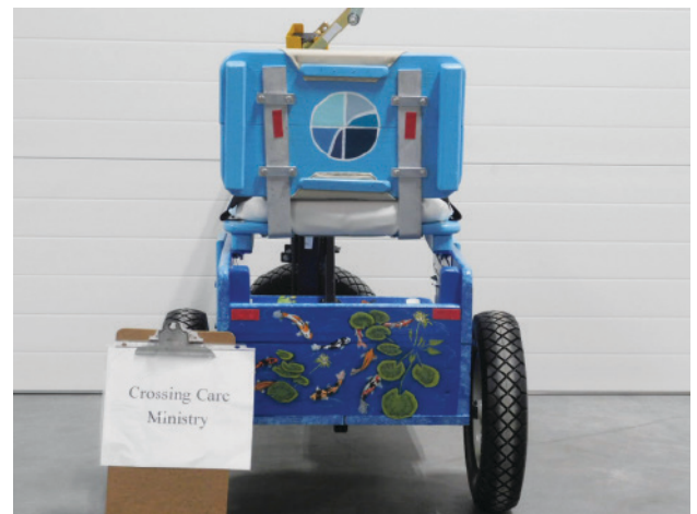
Crossing Care Ministry