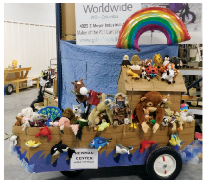
Newman Center Girls Night Out