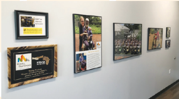
Main entrance and office hallway.