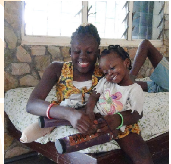
OTC website picture.