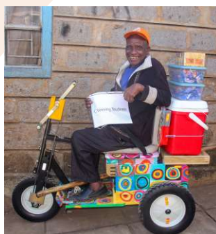
Crossing Students sponsored & Mini-Mart.