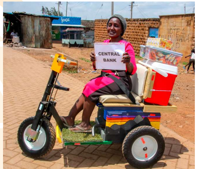
Central Bank sponsored