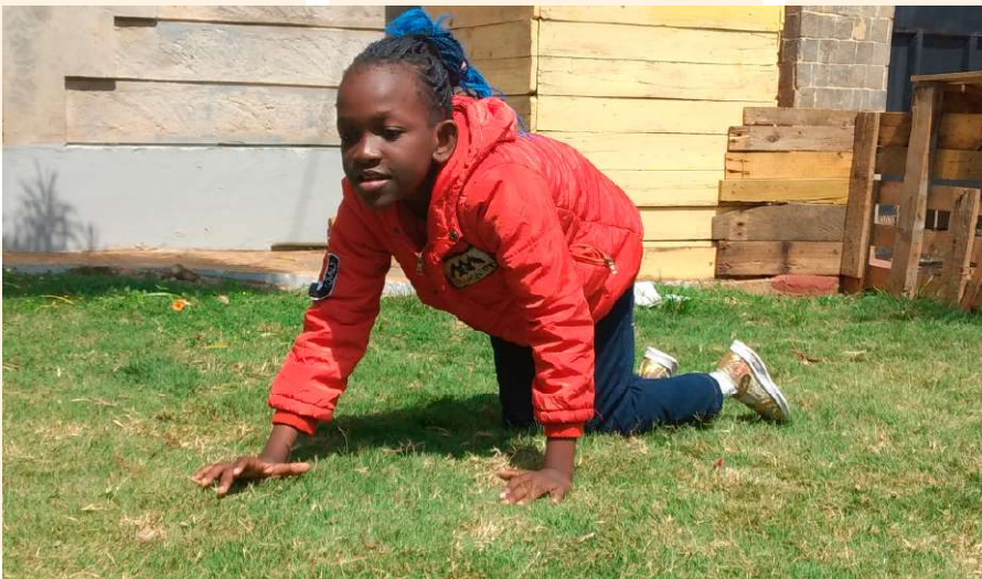
Veterans United sponsored