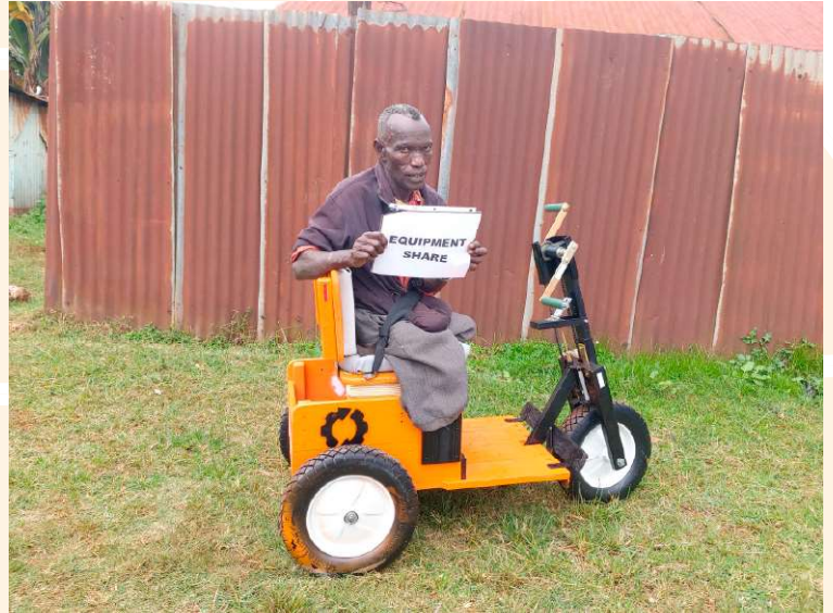
Equipment Share sponsored