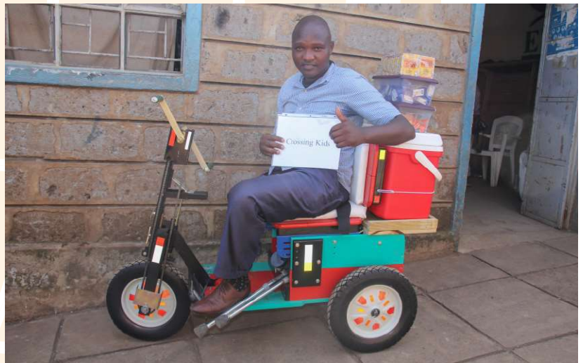
Crossing Kids sponsored a cart and Mini-Mart