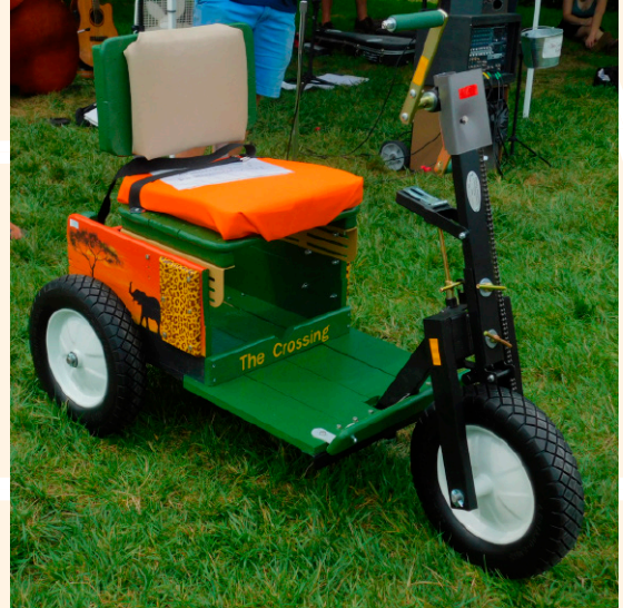
The Crossing judge's choice

Many gathered with the carts on a Sunday afternoon complete with a Mexican dinner. A live band and dancers portraying African dance added to the fun we all had. At the end several trailers were loaded to haul the 100 Mobility Carts to the shop. The net raised was $28,155. These carts shipped out in September to Kenya. The club is already planning for next year. Thank YOU to the Rotaract Club, sponsors and all that came and participated.