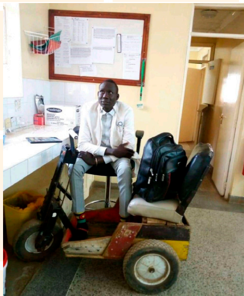
At school with cart and backpack