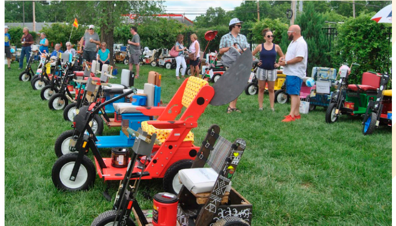
100 carts sponsored