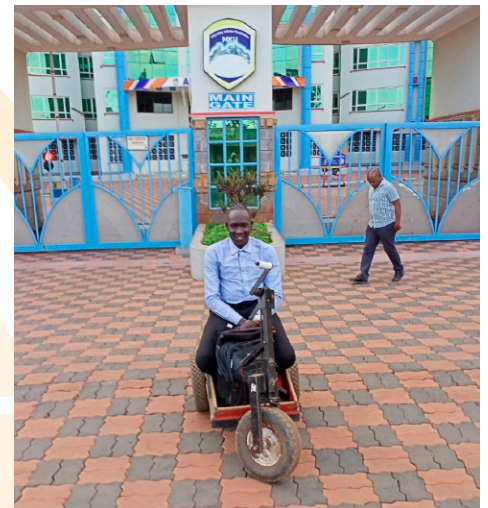
Mount Kenya University

“PEACE IS NOT THE ABSENCE OF CONFLICT, IT IS THE ABILITY TO HANDLE CONFLICT BY PEACEFUL MEANS.”