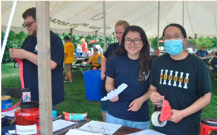
Rotaract Club members working ticket booth.

Many gathered with the carts on a Sunday afternoon complete with a Mexican dinner. A live band and dancers portraying African dance added to the fun we all had. At the end several trailers were loaded to haul the 100 Mobility Carts to the shop. The net raised was $28,155. These carts shipped out in September to Kenya. The club is already planning for next year. Thank YOU to the Rotaract Club, sponsors and all that came and participated.