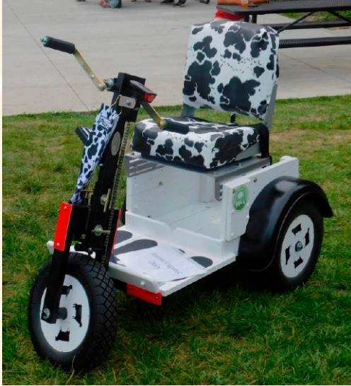
Aurora Organic Dairy best decorated