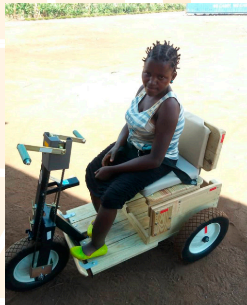
Back to school she goes.