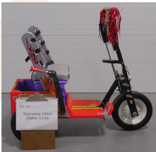
Marceline United Women of Faith Orpha Circle – People's Choice