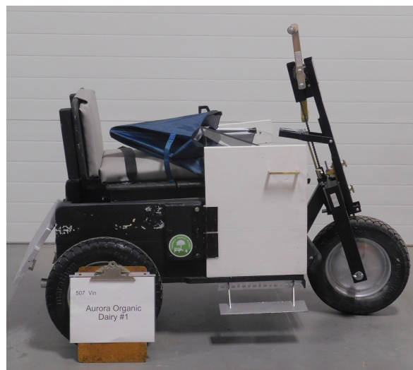
Aurora Organic Dairy - Rotaract's Favorite

The winning decorated cart was the crowd favorite from Marceline United Women of Faith Orpha Circle, and the Rotaract's favorite was one of three by Aurora Organic Dairy (2021 won People's Choice). Staff from our partner in Kenya, Partners for Care, shared their music. They will be receiving these carts later this fall or early 2023. We had attendees that traveled from Kenya, Atlanta, Oklahoma City, Wyandotte KS, and Odessa & central MO. Thank you all for attending, bringing friends and sponsoring carts to change someone's life. Thank you to our event sponsors ProEnergy Services from Sedalia, Mizzou Greek Life and Wyandotte United Methodist Church of KS.