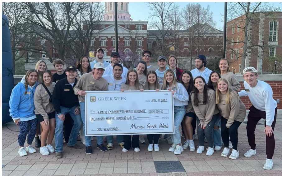
MU Greek Week sponsors 15 carts and gives $35,000.

On July 17, 100 decorated carts were delivered to our new location this year at the MU Health Care Pavilion in Columbia. We sold 333 wristbands, and maybe had another 100 attended briefly and did not stay. Live music entertained along with food and drinks. Attendees voted on their favorite cart.