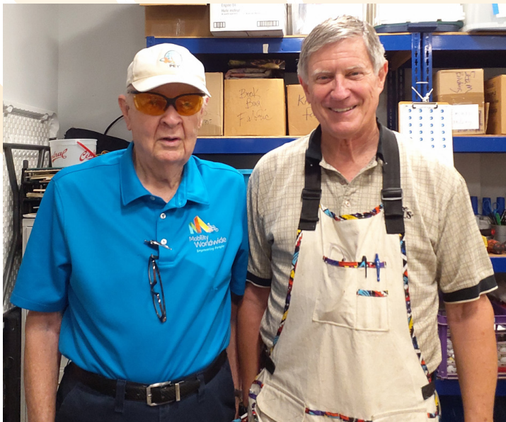
Yoda and Luke fight immobility for 28 years.

If you like to give online through CoMoGives, we are participating again. It is a county project of the Community Foundation of Central MO. It will begin with Giving Tuesday on November 29th. Our goal is $22,000. Let's see if we can break last year's record of $19,878. Your continued support is always appreciated.