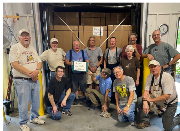
Hot load day for Sierra Leone.

Mobility Carts: 130 from Columbia, 40 from MWW Kansas; 10 Mini Marts, box of fasteners, and MANY crutches, walkers and more; 33 sewing machines from the Sewing Machine Project