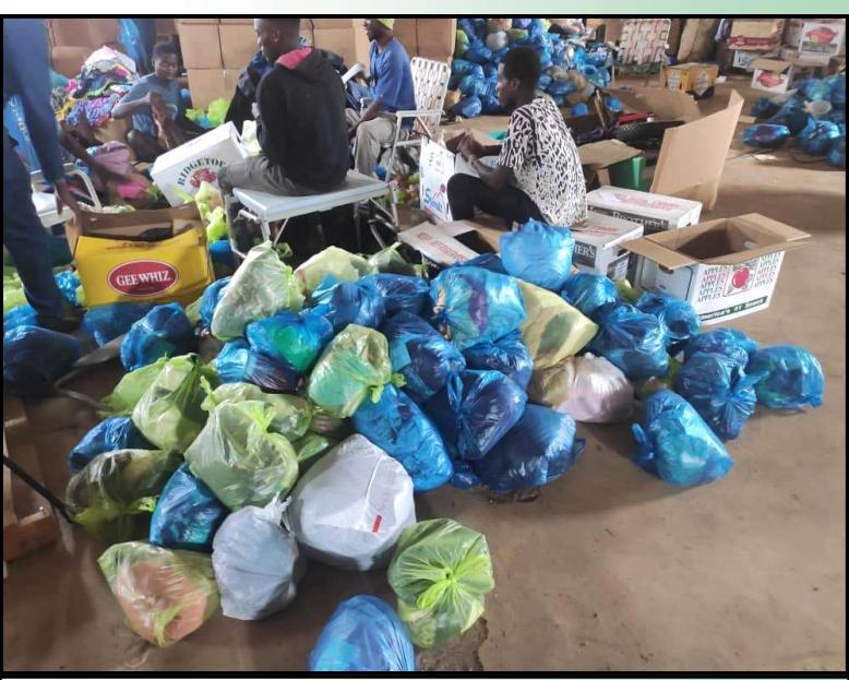
Two days after the cyclone, mounds of blue bags filled with clothes were distributed to people whose homes were destroyed by the floods.

This ready supply of "blue bag" clothing, together with food packets and other essentials being held by Action for Progress in its Distribution Center in Lilongwe, Malawi made it possible for AfP to be one of the first relief agencies on the scene. Within 2 days after the cyclone hit, AfP was administering critical aid to a suffering country. We are grateful our Shop could provide this clothing assistance in addition to our mobility carts.