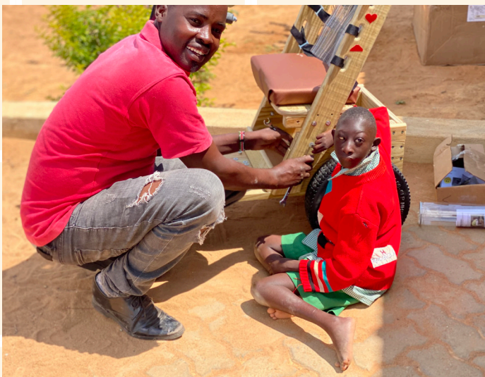
Boy assists with assembly of his cart in Kenya.