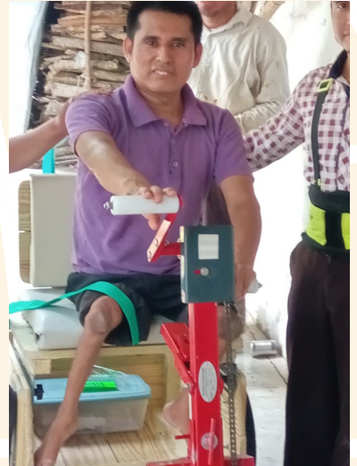
Mexico: Notice thin legs and strong upper body.