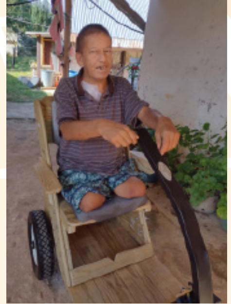
Pull Cart is given after an amputation.