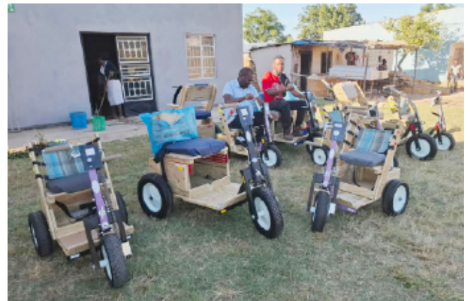
Mobility Carts will change lives in Malawi.